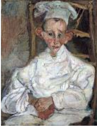
Chaim Soutine's Le pâtissier de Cagnes (estimate: £3,000,000-4,000,000)