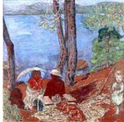
Pierre Bonnard, Bord de mer, sous les pins (estimate: £2,000,000-3,000,000)