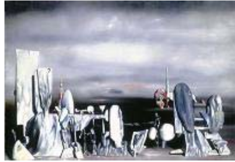
Yves Tanguy, Les derniers jours , 1944 (estimate: (2,000,000-3,000,000))

The sale features seven works by Joan Miró, the highlight of which is L'étoile (estimate: £1,500,000-2,000,000), an oil on canvas painted in May-June 1927, a museum quality canvas by the artist and, arguably, the best work in the series of 16 white background 'dream paintings' that the artist produced in the late 1920s. Miro's dream paintings marked the beginning of his aim to 'escape' the conventional limitations of painting and to create work that related to and existed within what he referred to 'the absolute of nature'. L'étoile , a poetic painting of great visual power has been enjoyed by a number of celebrated collectors, including Rene Gaffé, Roland Penrose and later, the film director Billy Wilder, who kept it for 25 years until he died. Peinture , a large oil on celotex painted in 1937 (estimate: £500,000-700,000), the year of the Spanish Civil War, is a further highlight by the artist.